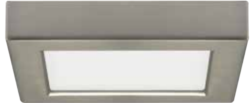
Brushed Nickel (BN)