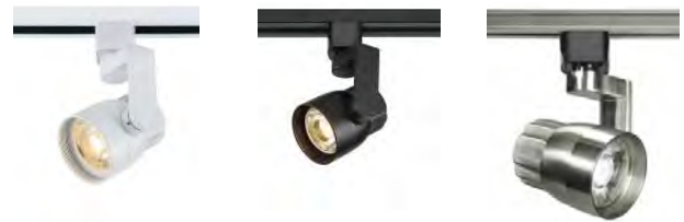
White-WHT Black-BLK Brushed Nickel-BN

Head Dimension: 2.69"H x 2.69"W x 3.38"L x 5.75"E Performance: 120V/12W/1000lms Del@30K/90 CRI Compatible with Type A Dimmers