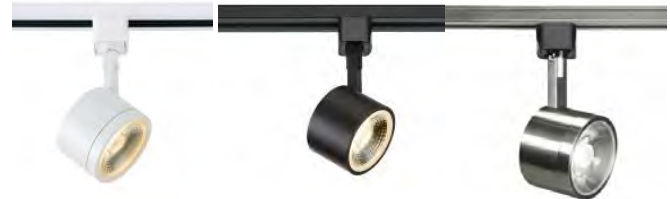
White-WHT Black-BLK Brushed Nickel-BN

Head Dimension: 3.19"H x 3.19"W x 2.25"L x 7.13"E Performance: 120V/12W/1000lms Del@30K/90 CRI Compatible with Type A Dimmers