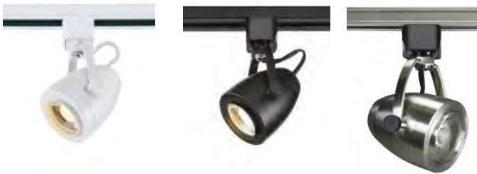
White-WHT Black-BLK Brushed Nickel-BN

Head Dimension: 2.81"H x 2.81"W x 3.63"L x 5.5"E Performance: 120V/12W/1000lms Del@30K/90 CRI Compatible with Type A Dimmers